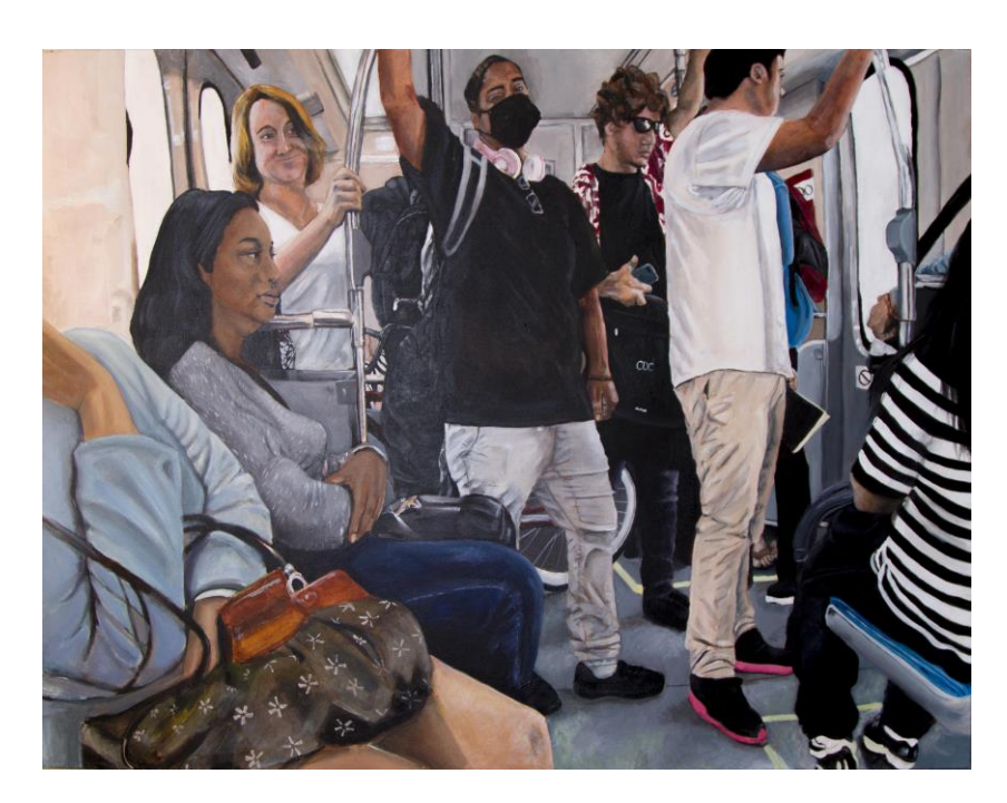
"Expo Line" Acrylic on canvas, from the series I, Voyeur painted from images taken on the metro in Los Angeles, 2017